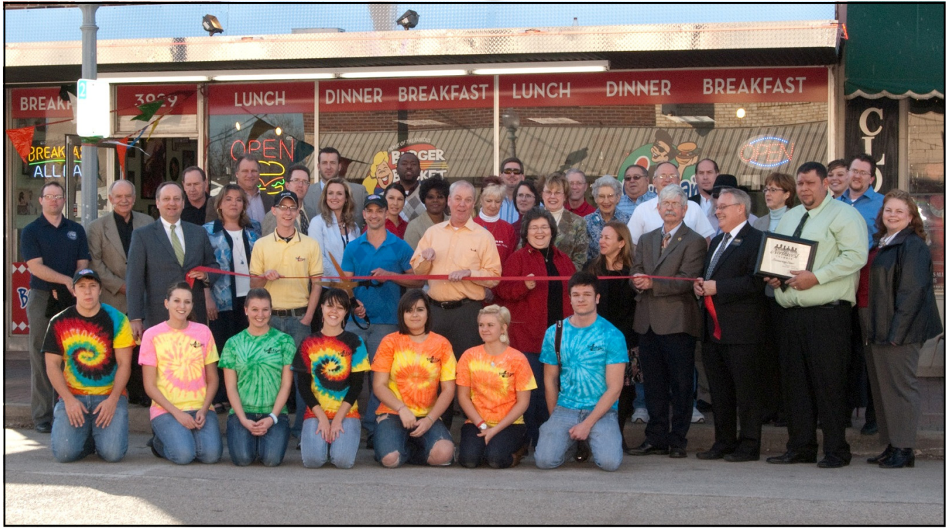
Northwest Chamber Members welcomed a new business to downtown Bethany and the Northwest Chamber on February 15, 2011 with a ribbon cutting ceremony. Boomarang Diner is a family operated restaurant with a comfortable diner atmosphere and friendly staff.